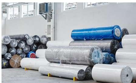
Foils in rolls

We buy out PP, PE, PP/PE and EVAC materials in all the displayed forms: