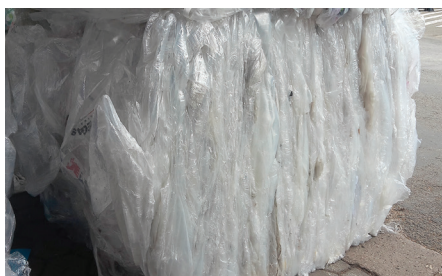
Foils compressed into bales